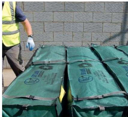
2. Load bags into work area and place in position