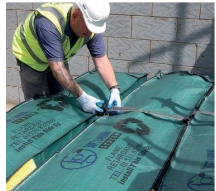
3. Check connectors are free of debris