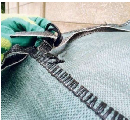
4. Thread webbing through double D-ring