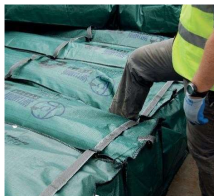
8. If the 'foot test' fails add more bags