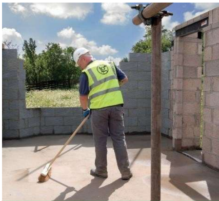
1. Clear debris from work area