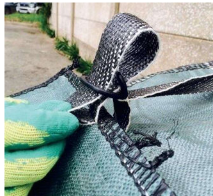
5. Return webbing as illustrated