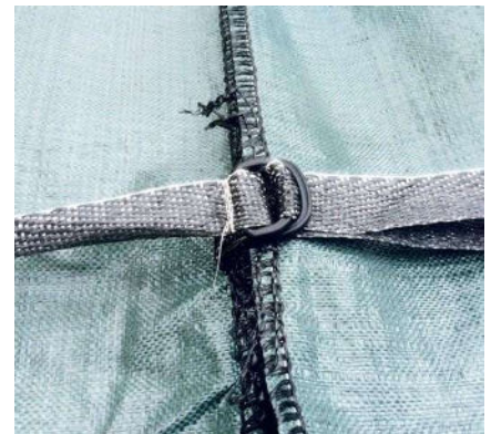
6. Pull tight to secure