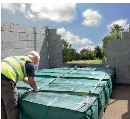
7. Continue to assemble until the floor area is covered