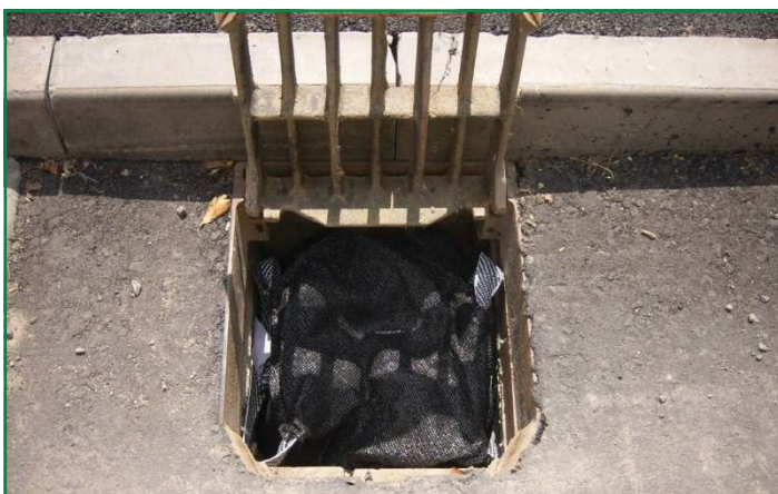
5. Close gully grid.