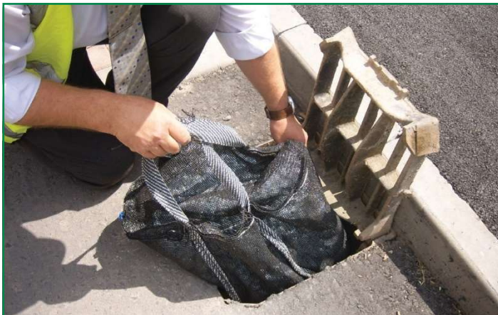
3. Lower the Gully Guard into the pot. The beads will fall freely into the void within the pot.