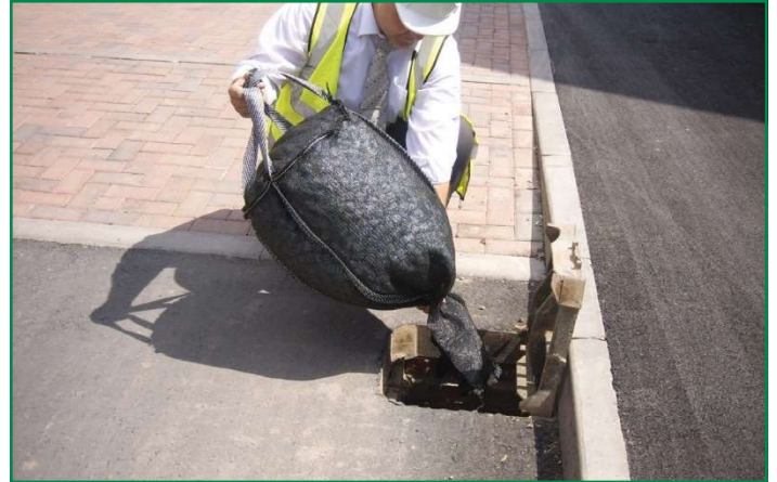
2. Hold handles at top of the Gully Guard, work beads to top and insert base into water filled gully pot.