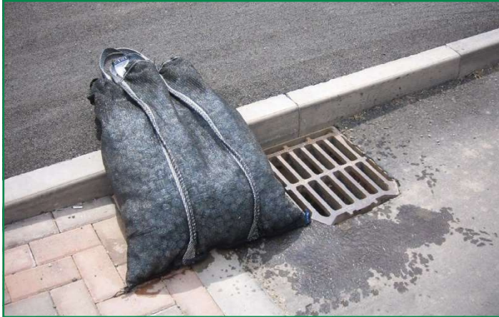
1. Lever open gully grid. Gully Guard is designed to fit all size gullies.