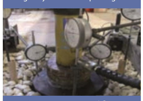
NTEC's compression and flow testing facility for load bearing surfaces.

NTEC's testing has demonstrated the suitability of Polybed as an alternative to traditional pipe and aggregate drainage systems in a range of transport applications such as highway and vehicle parking.