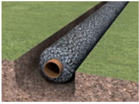
Connecting the 3m long Polybed sections is a quick 'click-fit' connection by the use of proprietary couplers.