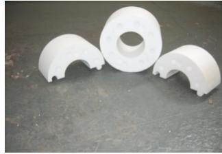
FD1206 Polybed Linking Collar Protector