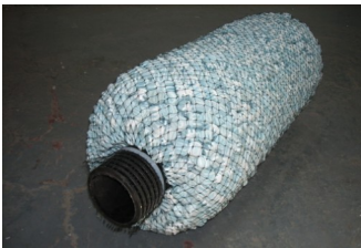
FD1233 Polybed 3m x 300mm Twin Wall Unperforated Plain Ended