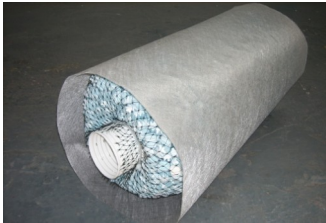
FD1231G Polybed 3m x 300mm Single Wall Perforated