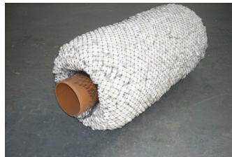
FD1241 Polybed 3m x 300mm Single Wall Solid Sewer Pipe Perforated Also available as FD1641 375mm diameter