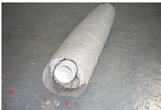
FD0331G Polybed Landdrain 3m x 175mm Single Wall Perforated