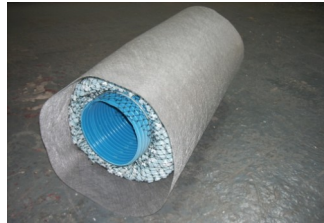
FD1631G Polybed 3m x 375mm Lightweight Fill